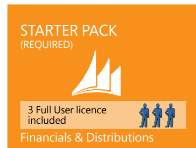
Figure 3: Starter Pack

A customer needs to license one Starter Pack per ERP Solution deployment. For many customers, this is the only Microsoft Dynamics license component they will need.