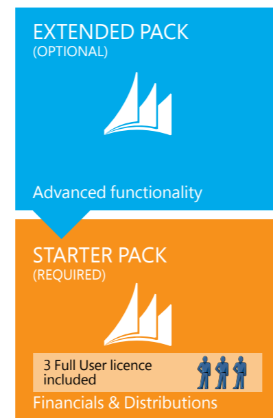
Figure 3: Extended Pack

The first three Full Users included in the Start Pack get to access to all of the incremental functionality.